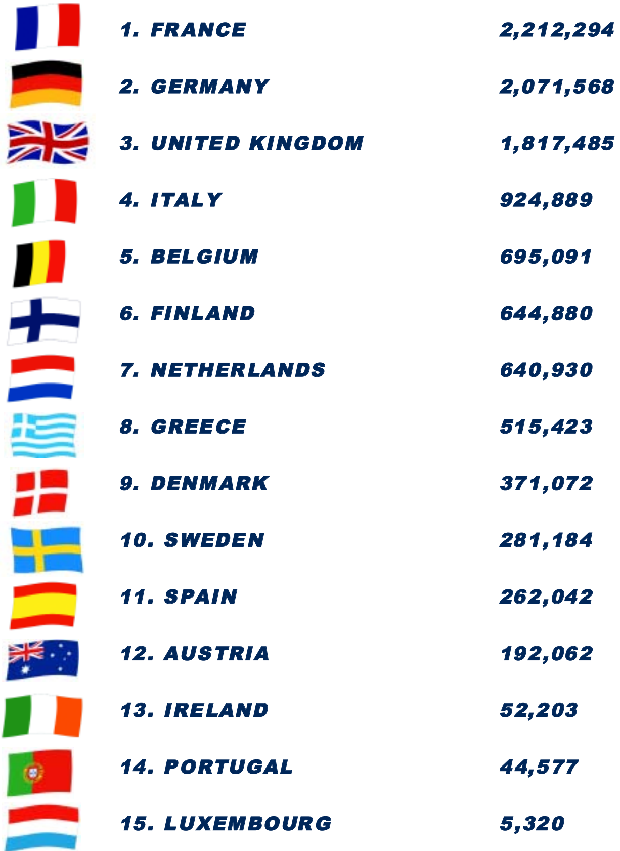
TABLE OF SHAME ANIMAL EXPERIMENTS