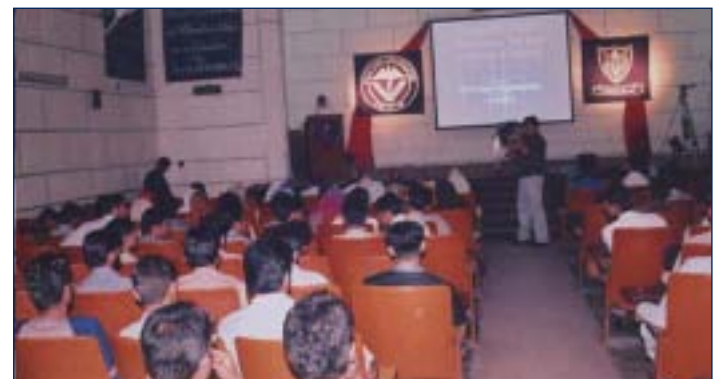
Television coverage at the IAAPEA Conference in Pakistan