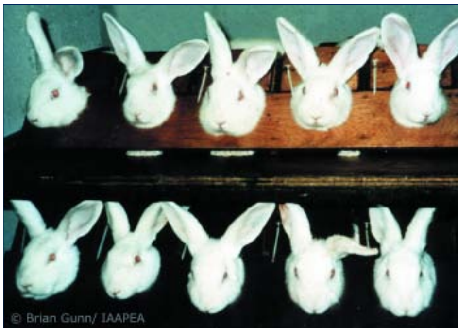
Victims of the Beauty Industry

1 10.7 million experiments were performed in 2002 (an increase of 9% since 1999).